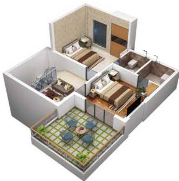
FIRST FLOOR ▶