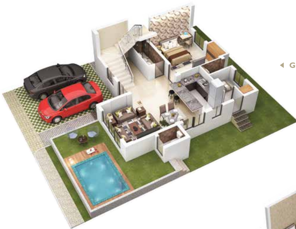
◀ GROUND FLOOR