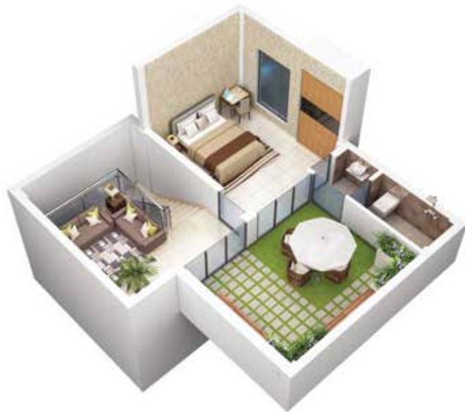
◀ SECOND FLOOR